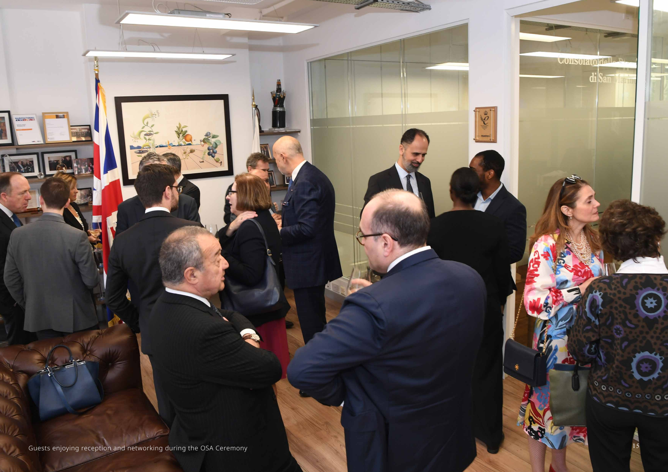
Guests enjoying reception and networking during the OSA Ceremony